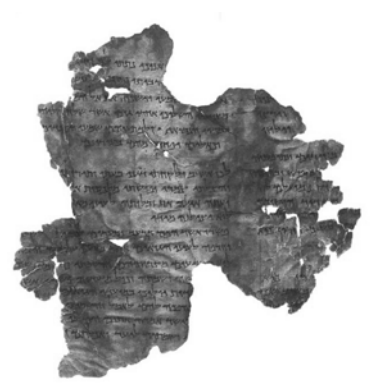
Hosea Commentary from the Dead Sea Scrolls.