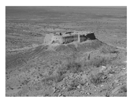
The Khoresmian fortress at Ayaz Kala in western Uzbekistan